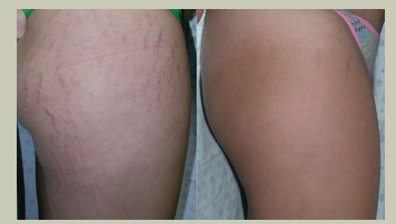
F 26Y, 1 month post 2nd treatment