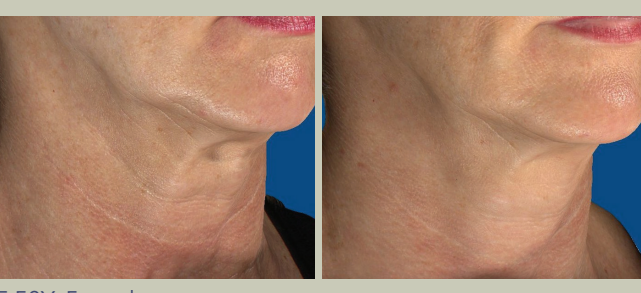
F 58Y, 5 weeks post treatment