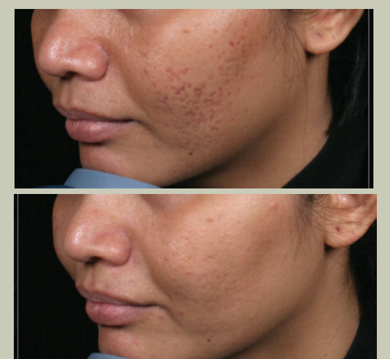
F 27Y, 6 months post 3rd treatment