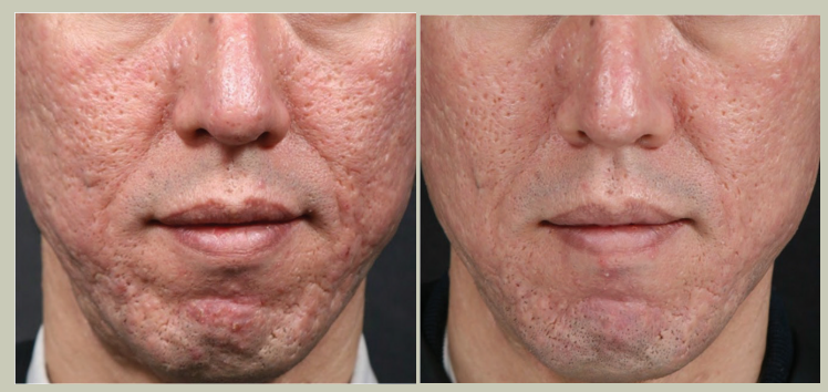
M 42Y, 7 days post treatment