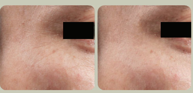
F 40Y, 4 weeks post 2 treatments