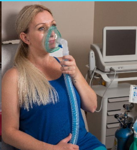
Nitrouseal® mask and circuit ideal for body procedures