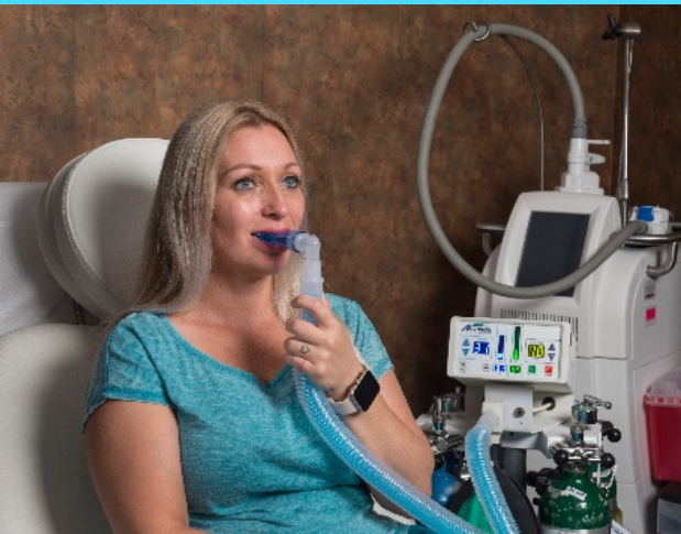
Mouthpiece and Nitrouseal® circuit ideal for facial procedures

The premium and only complete nitrous oxide system available.