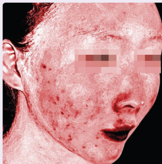
| After |