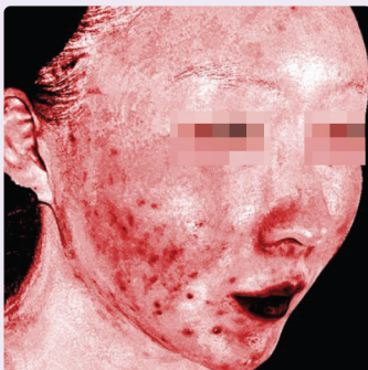
| Before |